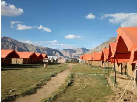
Dorje Camp or Gold-drop camp serchu