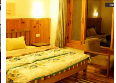
Keylinga inn Manali