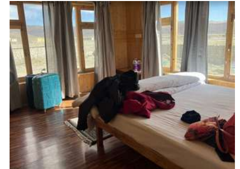
The Hor Cottage