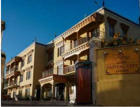
Capital City Hotel