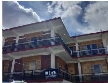
Grand Baspa resort/Baspa mud house