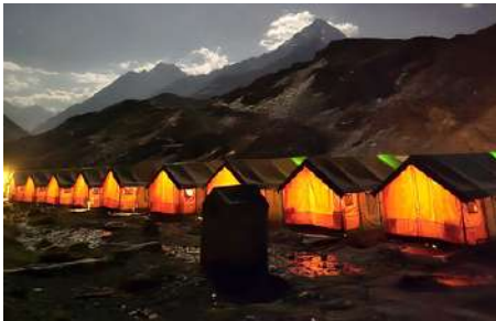
Dare the Himalaya