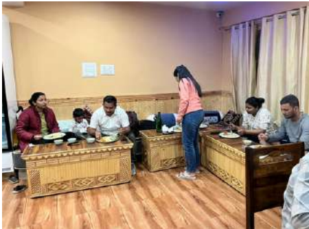
Tenzin Brothers / Yiga Homestay