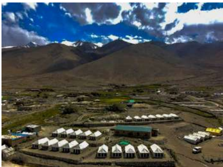
Pangong Heritage camp