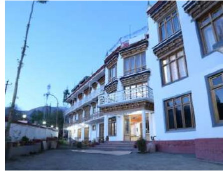
Hotel Horpo Leh