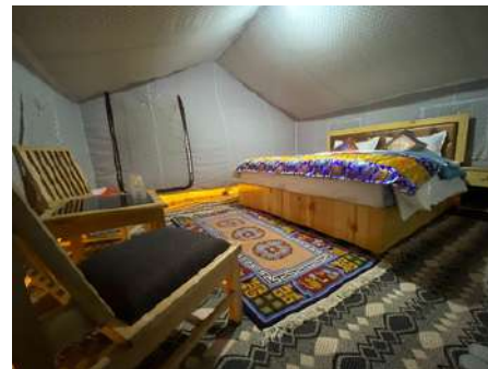
Frozen Pangong Camp