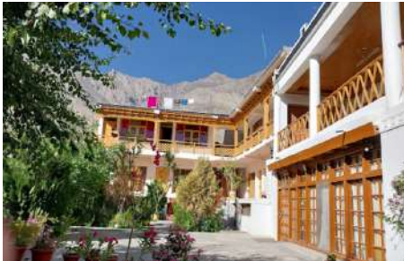
Sand dune hotel